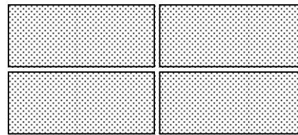
Form liner panel size: 112" x 48"